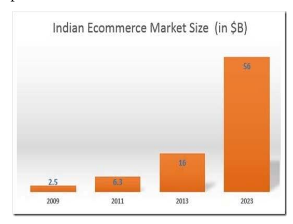
Fig 3: E-Commerce market growth in India [13]

6. Easy to Find the Review of Products - It is quite easy to find the review of products by the help of online shopping. E-commerce has made it simpler to get information regarding the product and the customers can purchase the products after getting reviews and feedback of the product.